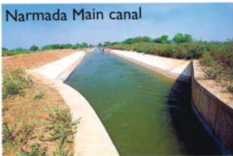
Narmada Main canal